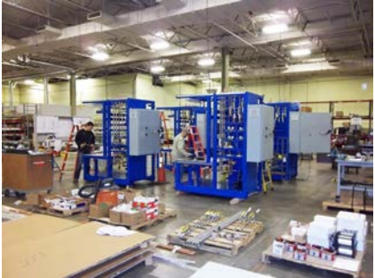
Fabrication and Assembly - Test Stands