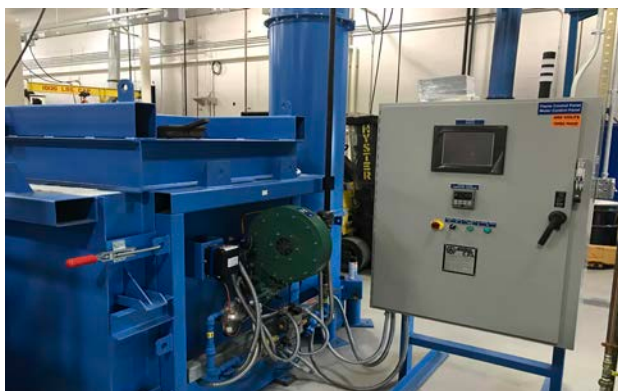
Equipment and Control Panel Installation

Optimization carries out fabrication at its industrial shops on Lexington Ave. in Rochester, NY. These shops house facilities for metal and sheet metal forming and fabrication as well as a UL-listed electrical fabrication and panel shop. Certifications are held to weld nearly every exotic alloy used for industrial processes.