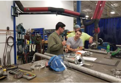
Award-Winning Apprenticeship Program