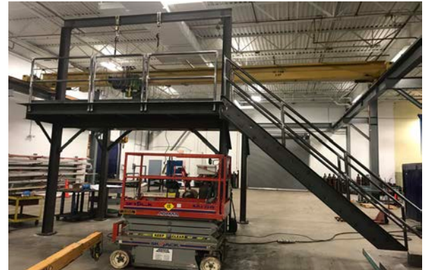
Platform Fabrication and Installation